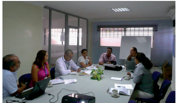
Fig. 3. Workshop on Identification of Environmental Impacts

Identification of impacts was performed by using a cause-effect matrix that contained the activities and the possible impacts according to previously defined processes and aspects. Every environmental