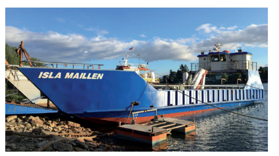
Fig. 1. Civilian landing craft for aquaculture support activities

The experimental data used for the preparation of the database came entirely from landing craft tank tests from the Hydrodynamic Test Tank