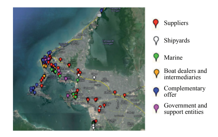
Fig. 1. Cluster Map in Cartagena

the bay, human resources that are qualified and trained for the care of vessels up to 600 tonnes, an adequate infrastructure and canal of 3,600 tons per boat. In 2016 the shipyard sector that is part of the cluster had more than 70 actors that are part of the shipyard sector, 85% of the ship building activity is located in Cartagena with more than 3000 workers. Cartagena is recognized for its military and commercial shipyards, highlighting the leading role of Cotecmar at the forefront of research and development activities<sup>10</sup>.